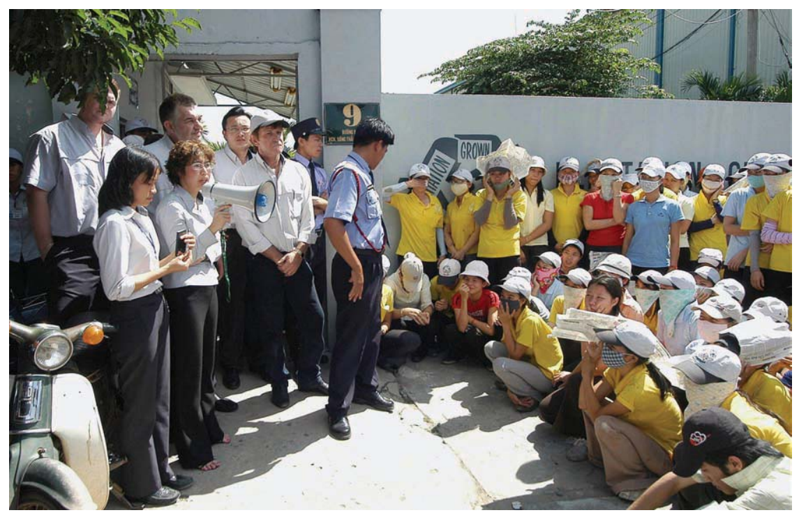
Management talking with workers during a strike at a foreign company in southern Binh Duong Province in January 2006. Foreign companies have flocked to Vietnam, drawn in part by its low daily wages. Waves of strikes in recent years have caused alarm among the business community and the government.

Strikes are prohibited in 54 sectors considered to provide essential public services or be important to national security or the national economy, including the transportation, banking, and postal sectors; oil, gas, and forestry enterprises; and power stations.<sup>44</sup> The prime minister can terminate any strike considered to be a threat to public safety or to the national economy.<sup>45</sup> Furthermore, government regulations impose fines of up to three months' pay on workers who participate in strikes declared unlawful by a People's Court, to compensate employers for losses incurred as a result.<sup>46</sup>