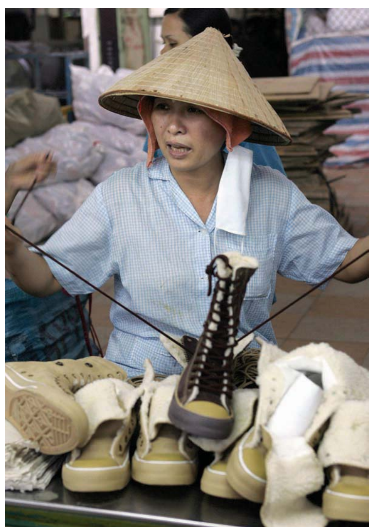
A worker at a South Korean footwear company in southern Dong Nai Province where nearly 14,000 workers went on strike in July 2008 to demand higher salaries.

Workers are also striking to express their grievances over poor working conditions, and in some cases, their mistreatment by foreign managers, including physical and verbal abuse and sexual harassment.<sup>58</sup>